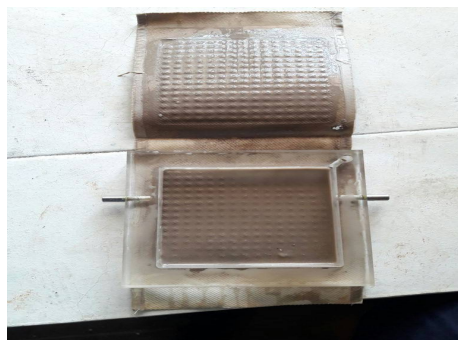
Fig.8: Mud cake when CMC added.