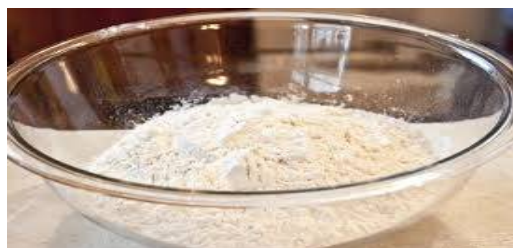
Fig. 3: Xanthan Gum

Xanthan gum is a polysaccharide secreted by the bacterium Xanthomonas campestris , used as a food additive and rheology modifier commonly used as a food thickening agent and a stabilizer (in cosmetic products, for example, to prevent ingredients from separating). It is composed of pentasaccharide repeat units, comprising glucose, mannose, and glucuronic acid in the molar ratio 2:2:1. It is produced by the fermentation of glucose, sucrose, or lactose. After a fermentation period, the polysaccharide is precipitated from a growth medium with isopropyl alcohol, dried, and ground into a fine powder. Later, it is added to a liquid medium to form the gum