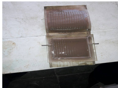
Fig.7: Mud cake when PAM added.