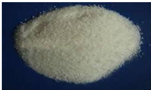
Fig. 4: PAM (polyacrylamide)

PAM is a polymer ( -\text{CH}_2\text{CHCONH}_2- ) formed from acrylamide subunits. It can be synthesized as a simple linear-chain structure or cross-linked, typically using N,N'-methylenebisacrylamide. In the cross-linked form, the possibility of the monomer being present is reduced even further. It is highly water-absorbent, forming a soft gel when hydrated, used in such applications as polyacrylamide gel electrophoresis, and can also be called ghost crystals when cross-linked, and in manufacturing soft contact lenses. In the straight-chain form, it is also used as a thickener and suspending agent