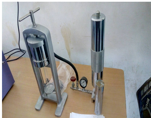
Fig. 2: Filter press

Two plates join together to form a chamber to pressurize the slurry and squeeze the filtrate out through the filter cloth lining in the chamber. It is capable of holding 12 to 80 plates adjacent to each other, depending on the required capacity. When the filter press is closed, a series of chambers is formed. The differences with the plate and frame filter are that the plates are joined together in such a way that the cake forms in the recess on each plate, meaning that the cake thickness is restricted to 32mm unless extra frames are used as spacers. However, there are disadvantages to this method, such as longer cloth changing time, inability to accommodate filter papers, and the possibility of forming uneven cake.