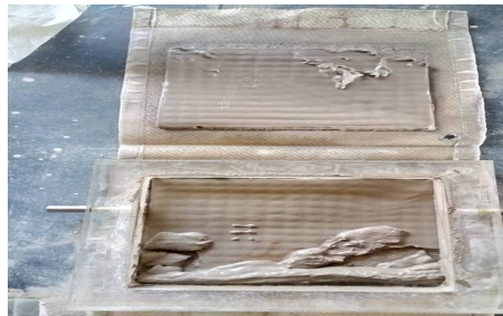
Fig.6: Mud cake of ordinary mud.