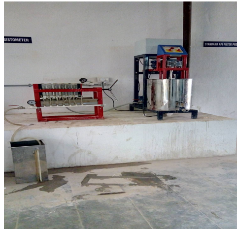
Fig. 1: Filter Press