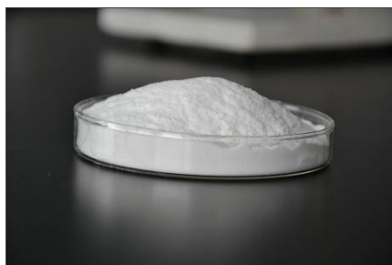
Fig. 5: CMC (carboxymethyl cellulose)

It is also a constituent of many non-food products, such as toothpaste, laxatives, diet pills, water-based paints, detergents, textile sizing, and various paper products.